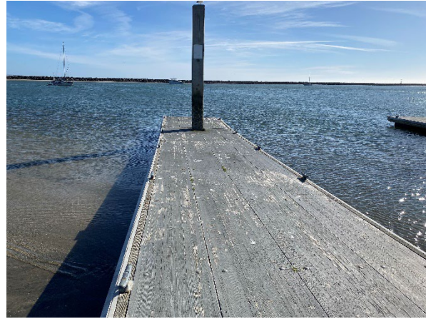
Pile-Guided Boarding Float

San Mateo County Harbor District $400,000 Grant (Planning)