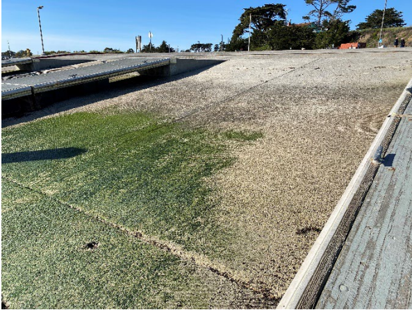
Boat Launch Ramp